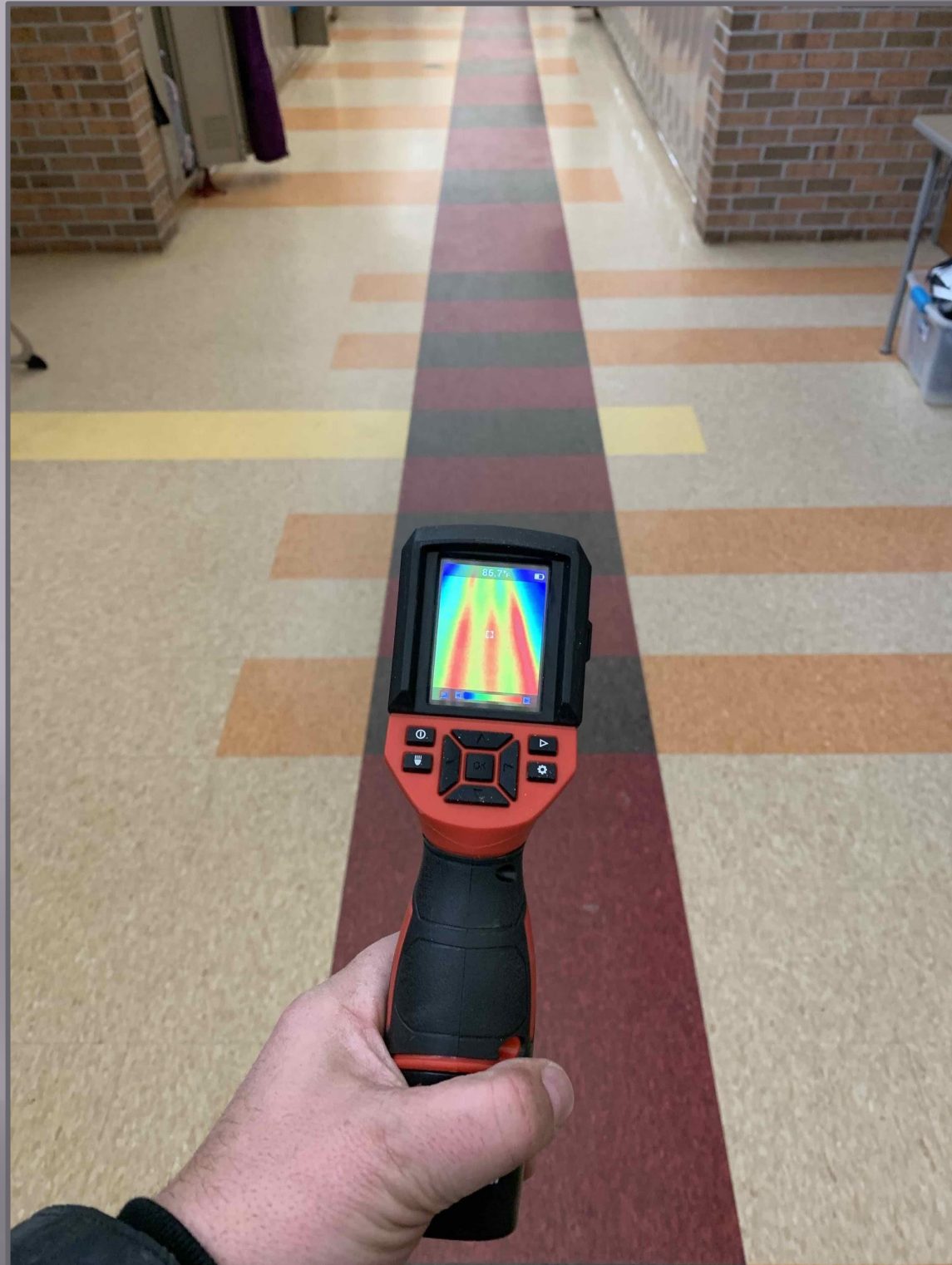
Heat sensor traces in floor heating lines.