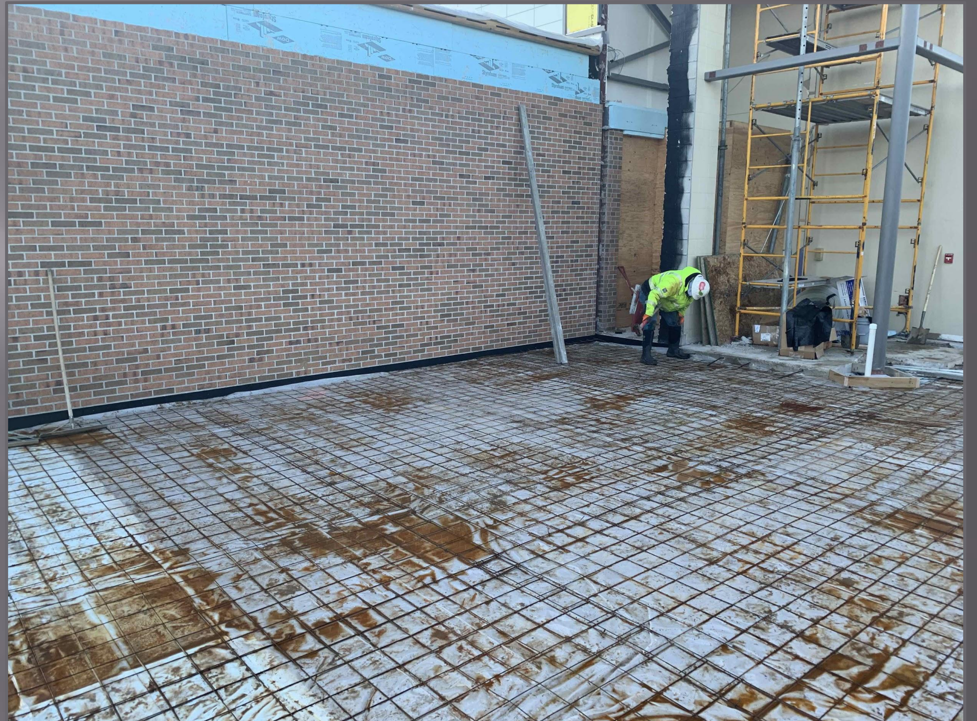
Rebar installed for new slab.