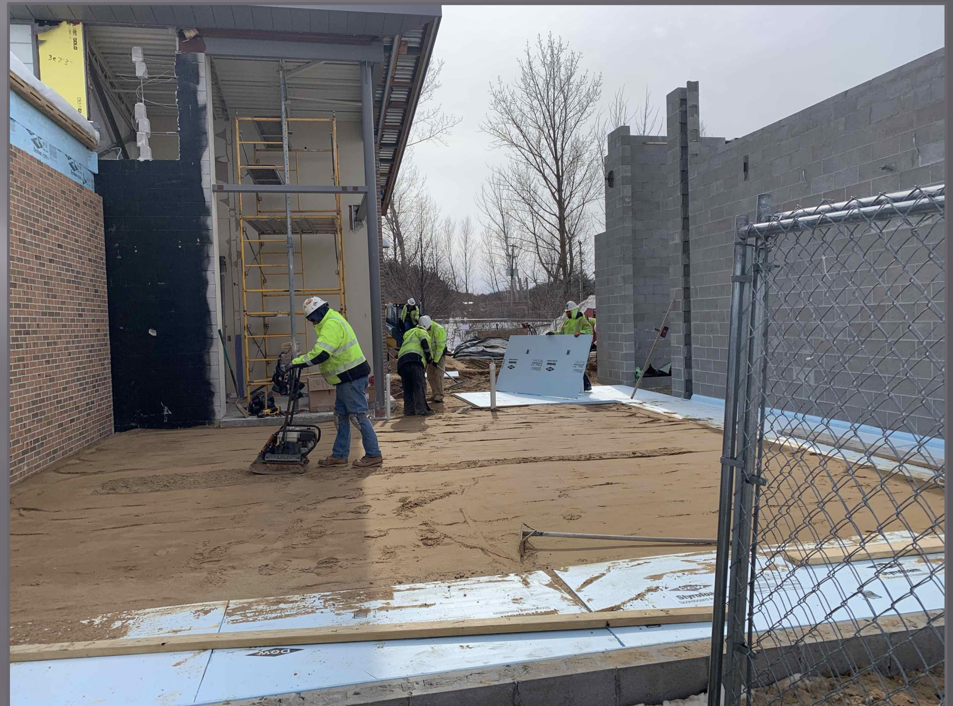
Compacting base for new slab.