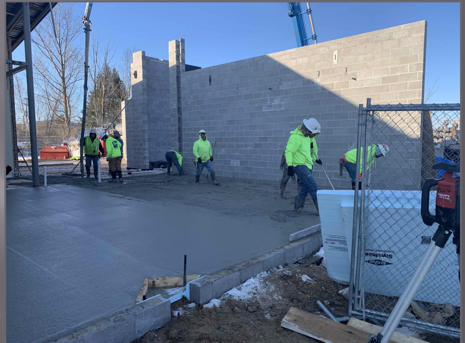
New slab being poured.