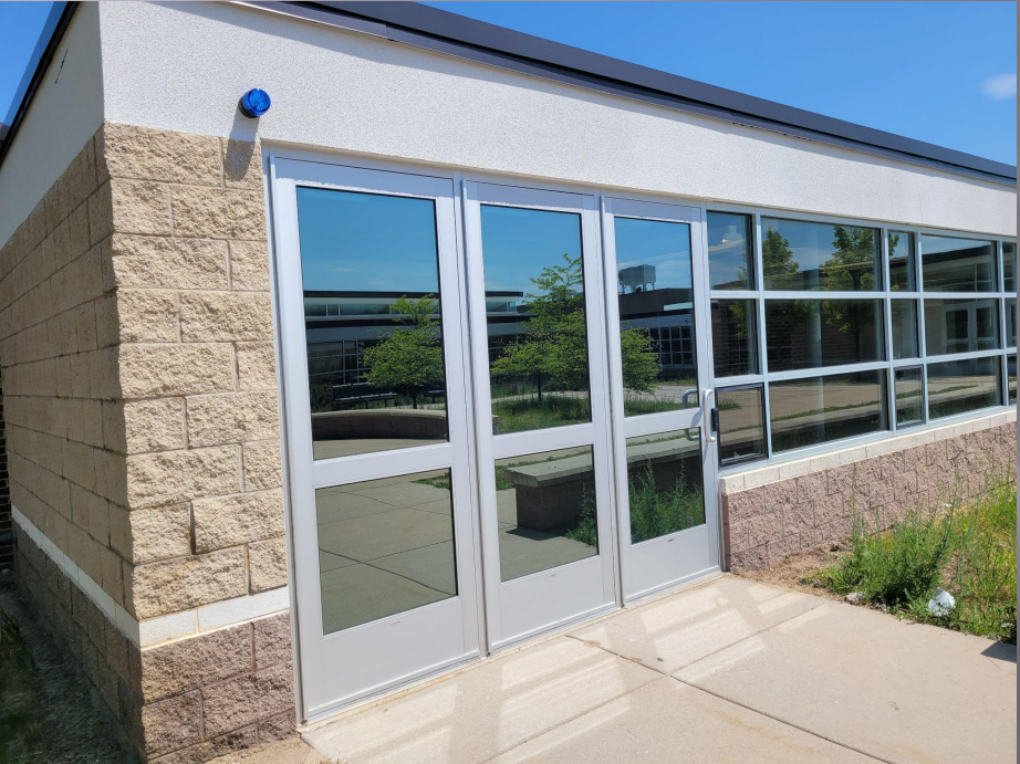
Blair, Courtade, Silver Lake, Westwoods, West Middle, East Middle, West Senior, Central High