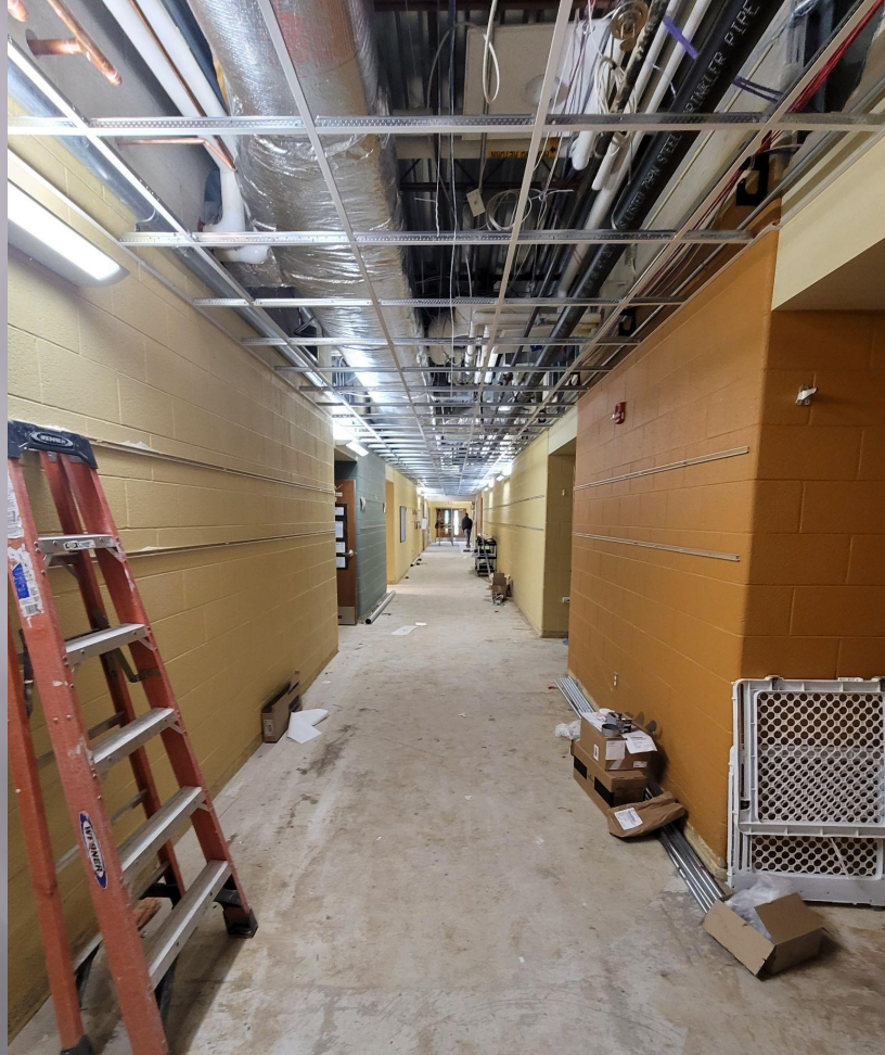
TRAVERSE HEIGHTS ELEMENTARY